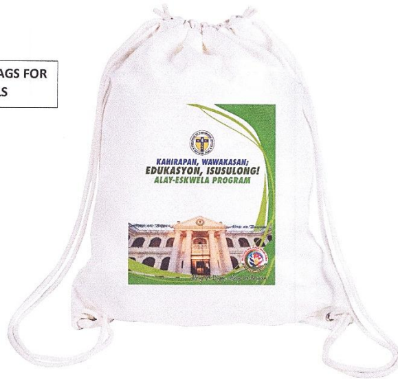
CUSTOMIZED STRING BAGS FOR ALL GRADE LEVELS