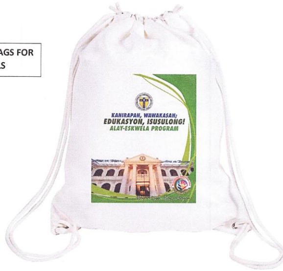
CUSTOMIZED STRING BAGS FOR ALL GRADE LEVELS